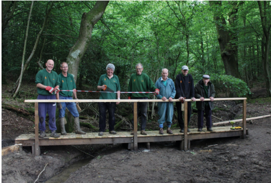
The (slightly improvised) official opening of the new bridge in Hornecourt Wood!

You may notice if you wander into Hornecourt Wood, that there's recently been a new wooden bridge constructed over the stream at southern end of the wood.